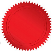
James Shipton Chair